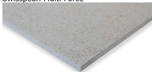
Swisspearl Multi Force