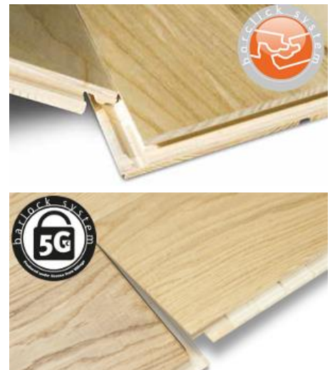
Fig. 2. Views of Barlinek floorboards with 5Gc BARLOCK and BARCLIK systems