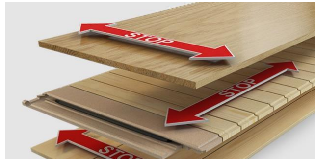
Fig. 1. Cross structure of 3-layer wooden floorboard produced by Barlinek Invest LLC

Barlinek parquet board is made from three layers of real wood arranged in a cross structure (Fig. 1) in order to prevent swelling, squeaking or drying out causing splits. The cross construction reduces natural tension and compression of wood, provides a balance between the layers of the board, and thus guarantees the stability of the floor, even under changing weather conditions outside. The Barlinek parquet board's layered structure ensures the floor's stability and is suited for underfloor heating. The parquet boards are joined using 5Gc joints and Barlik (Fig. 2) which allow to lay the floor without most of the tools which are usually necessary to install a floor. Specification of the product is shown in Table 1.