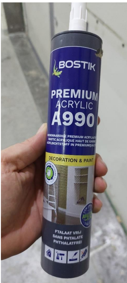
Picture 2. Cartridge of the sample