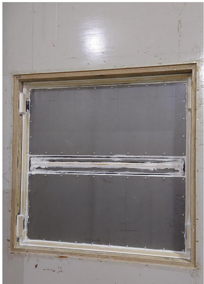
Picture 3. Test element installed to the test wall opening