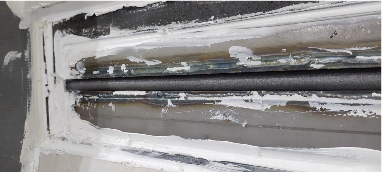
Picture 1. Backer rod installed to the test gap