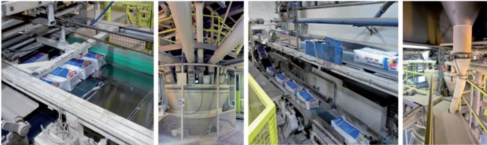
Figure 1: production process detail

The production process starts from raw materials, that are purchased from external and intercompany suppliers and stored in the plant. Bulk raw materials are stored in specific silos and added automatically in the production mixer, according to the formula of the product. Other raw materials, supplied in bags, big bags or tanks, are stored in the warehouse and added automatically or manually in the mixer. The production is a discontinuous process, in which all the components are mechanically mixed in batches. The semi-finished product is then packaged, put on wooden pallets and stored in the finished products warehouse. The quality of final products is controlled before the sale.