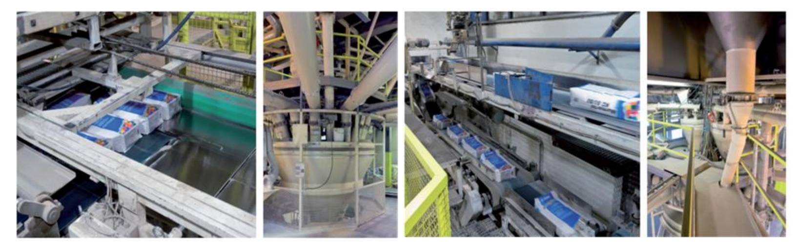
Figure 1: production process detail

The production process starts from raw materials, that are purchased from external and intercompany suppliers and stored in the plant. Bulk raw materials are stored in specific silos and added automatically in the production mixer, according to the formula of the product. Other raw materials, supplied in bags, big bags or tanks, are stored in the warehouse and added automatically or manually in the mixer. The production is a discontinuous process, in which all the components are mechanically mixed in batches. The semi-finished product is then packaged, put on wooden pallets and stored in the finished products warehouse. The quality of final products is controlled before the sale.